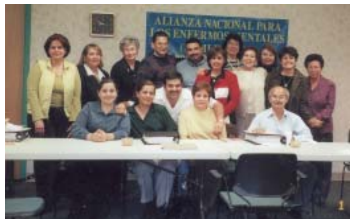
NAMI Spanish Family to Family Training in El Paso, TX.

The Assertive Community Treatment (ACT) Technical Assistance Center at NAMI continues to recognize consumers and families as key service providers, and supports NAMI advocates across the country in their efforts to sustain the fidelity of this evidence-based treatment program.