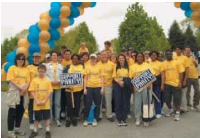
The NAMI National Team pauses for a photo at the completion of the NAMI Maryland Walk in May 2003.

Over the next year, NAMI will boost efforts to diversify funding and address new strategic goals through the promising Mind of America Foundation and its advisory council, continued outreach to individual and corporate supporters, NAMIWalks, and grants work.