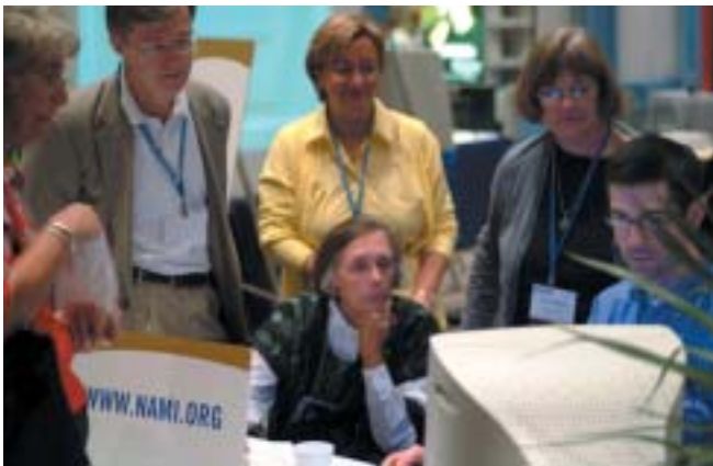
Convention attendees stop in NAMILand for a demonstration of the new NAMI Web site.

NAMI's 24 th Annual Convention was held in Minneapolis in June 2003. More than 2,200 attendees from all over the United States, including more than 400 consumers, and international partner representatives from other organizations, joined in the exciting four days of workshops, networking and multi-media presentations.