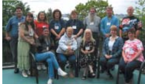
Group photo from the Peer to Peer Train the Trainers event held June 6-8, 2003, in Providence, RI.

The NAMI C.A.R.E. peer support group model is in demand. Because providing support is foundational for NAMI, the importance of providing the best training and ongoing technical assistance is paramount.