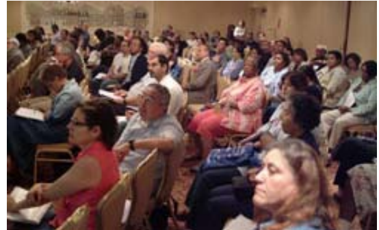
Attendees at the "Eliminating Disparities in Mental Health Care" session, part of the Multicultural Strategic Summit.

This event was the culmination of a five-year series of symposia to highlight mental health issues in the African American, American Indian, Asian American, and Latino communities. As part of NAMI's National Convention in Washington, D.C., the Summit brought several organizations and over 300 mental health advocates together to address issues involving mental health within all ethnic minority communities, the achievement of cultural competence, and the elimination of disparities. During the Summit's Town Hall meeting, advocates came up with over 50 action items for a plan to eliminate disparities in mental health.